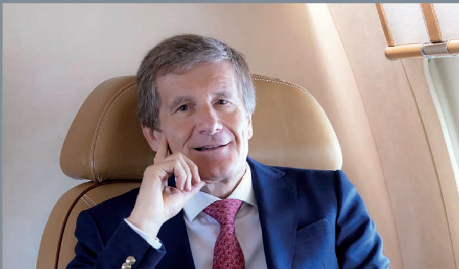
Thierry Boutsen | Founder

Thierry Boutsen's passion for aviation began during his studies in mechanical engineering. After graduating, he continued to push his limits both intellectually and physically by becoming a professional racecar driver, eventually becoming a renowned Formula One champion.