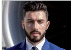
Benjamin Ribouveau Aircraft Sales