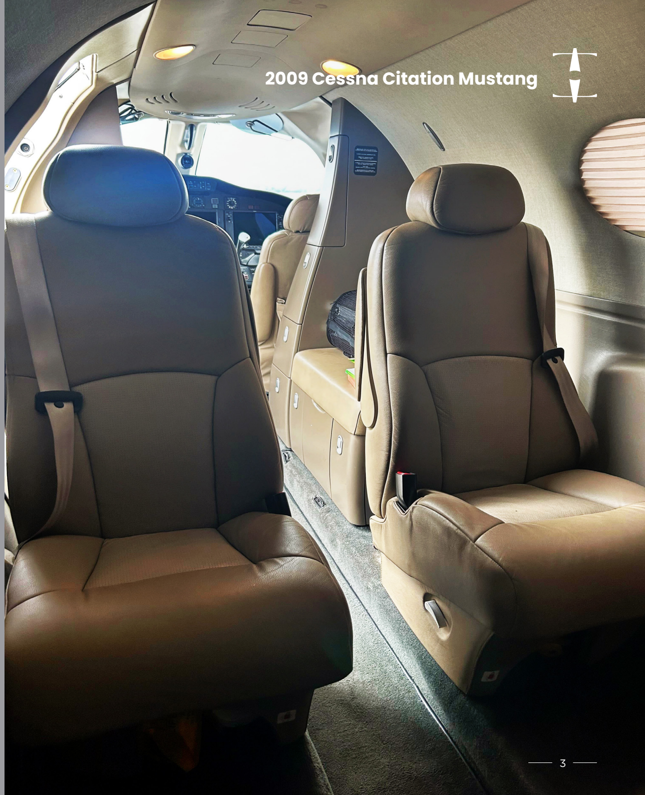
2009 Cessna Citation Mustang