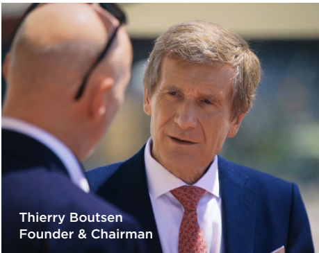
Thierry Boutsen Founder & Chairman