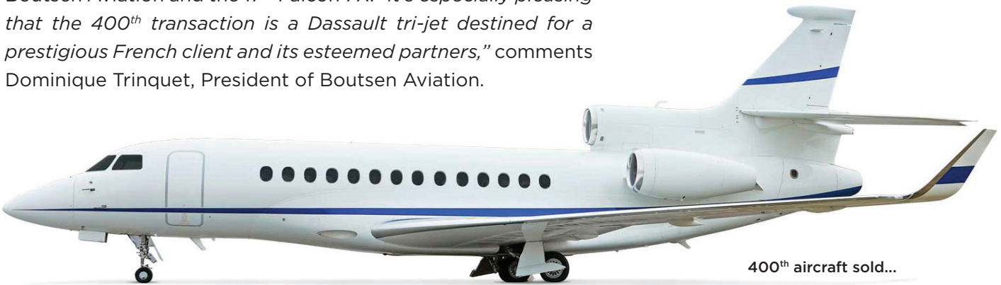
400 th aircraft sold...