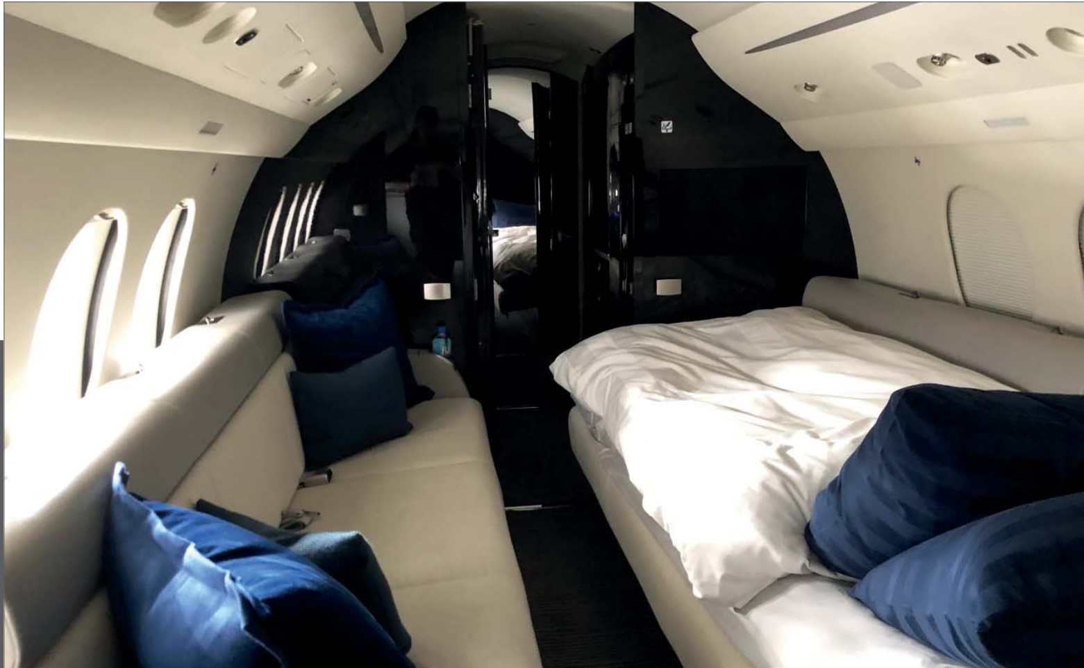
2016 Dassault Falcon 7X - MSN 272