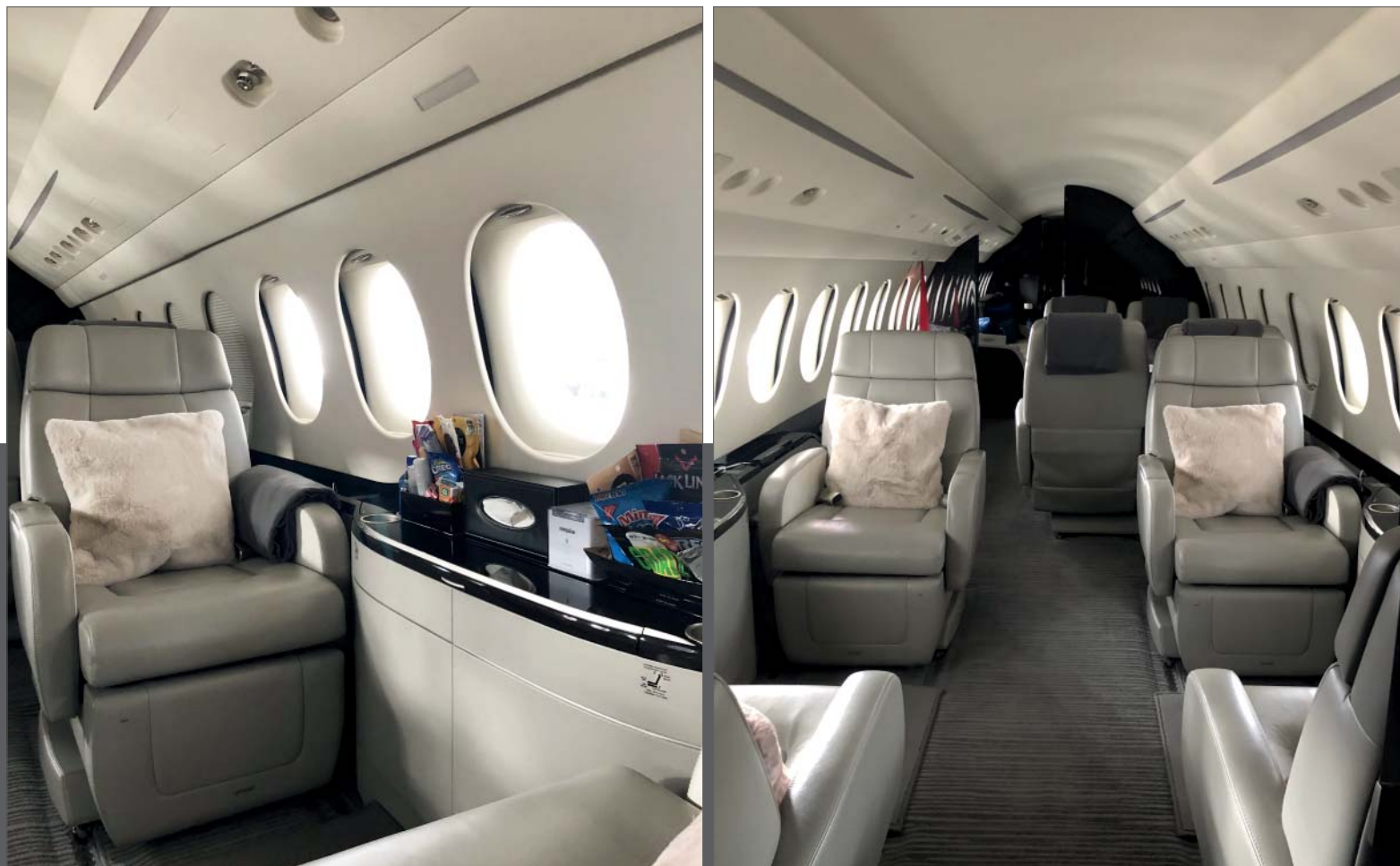
2016 Dassault Falcon 7X - MSN 272