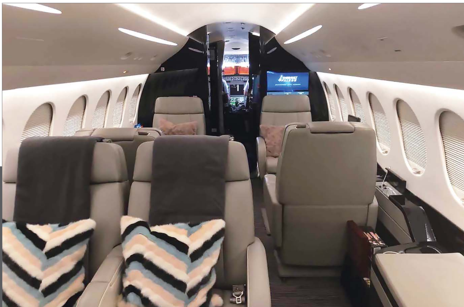
2016 Dassault Falcon 7X - MSN 272