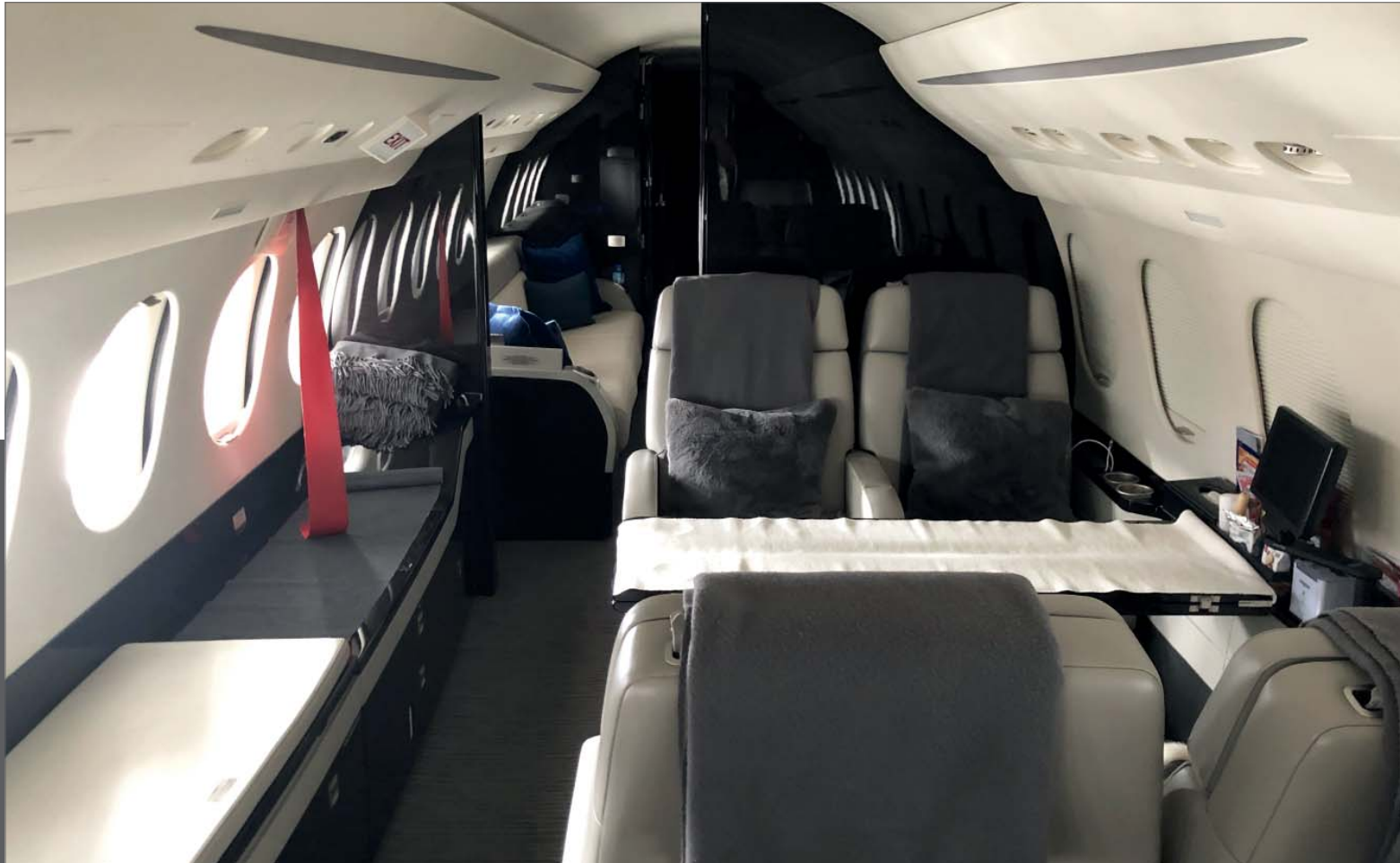
2016 Dassault Falcon 7X - MSN 272